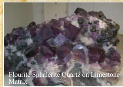
Fluorite Sphalerite Quartz on Limestone Matrix

interest in the fledgling fluorspar industry was centered in Crittenden County. He ran the Alpine, Holly Davenport, and National Fluorspar Companies from 1919 to 1950.