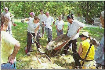
Teaching Alternative Spring Break students the importance of protecting the environment and respecting the past.

Provides thousands of hours of volunteer assistance to LBL activities and programs